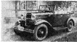
8. My first motor car—a present from Sergo Ordzhonikidze